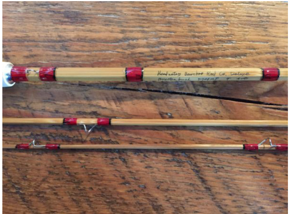
The detail of the Headwaters Bamboo Fishing Rod, one of the Special Raffles in our upcoming banquet. Tickets are only $25!