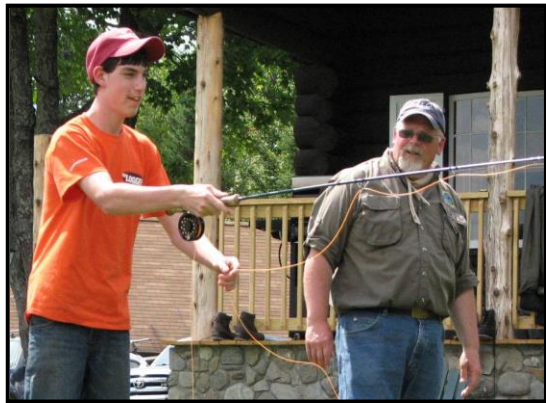
“The instructors made casting fun. They share tips that are easy to remember.”