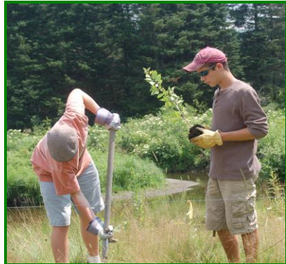
“We planted 120 trees to save the river bank. Protecting the environment means we will have great places to fish.”